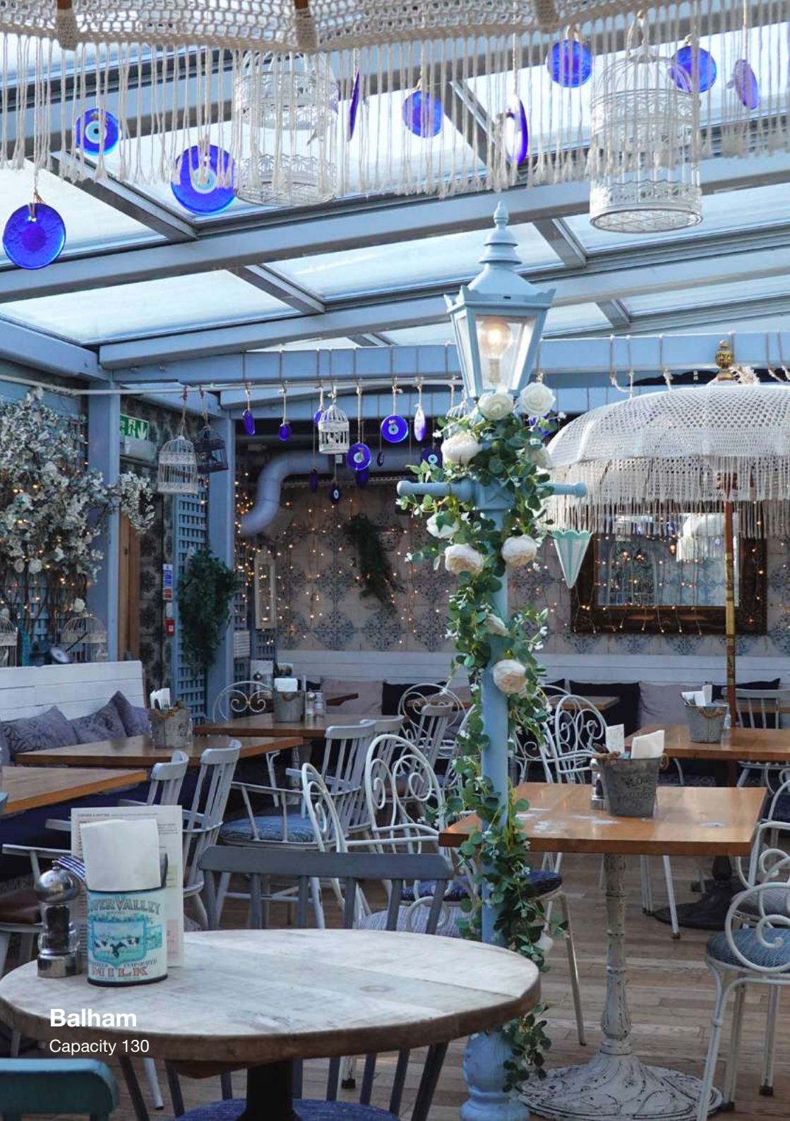
Balham Capacity 130