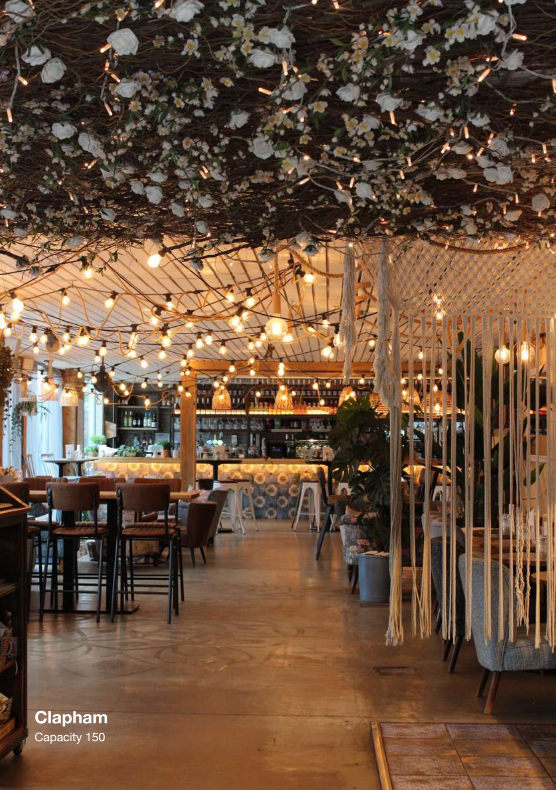
Clapham Capacity 150