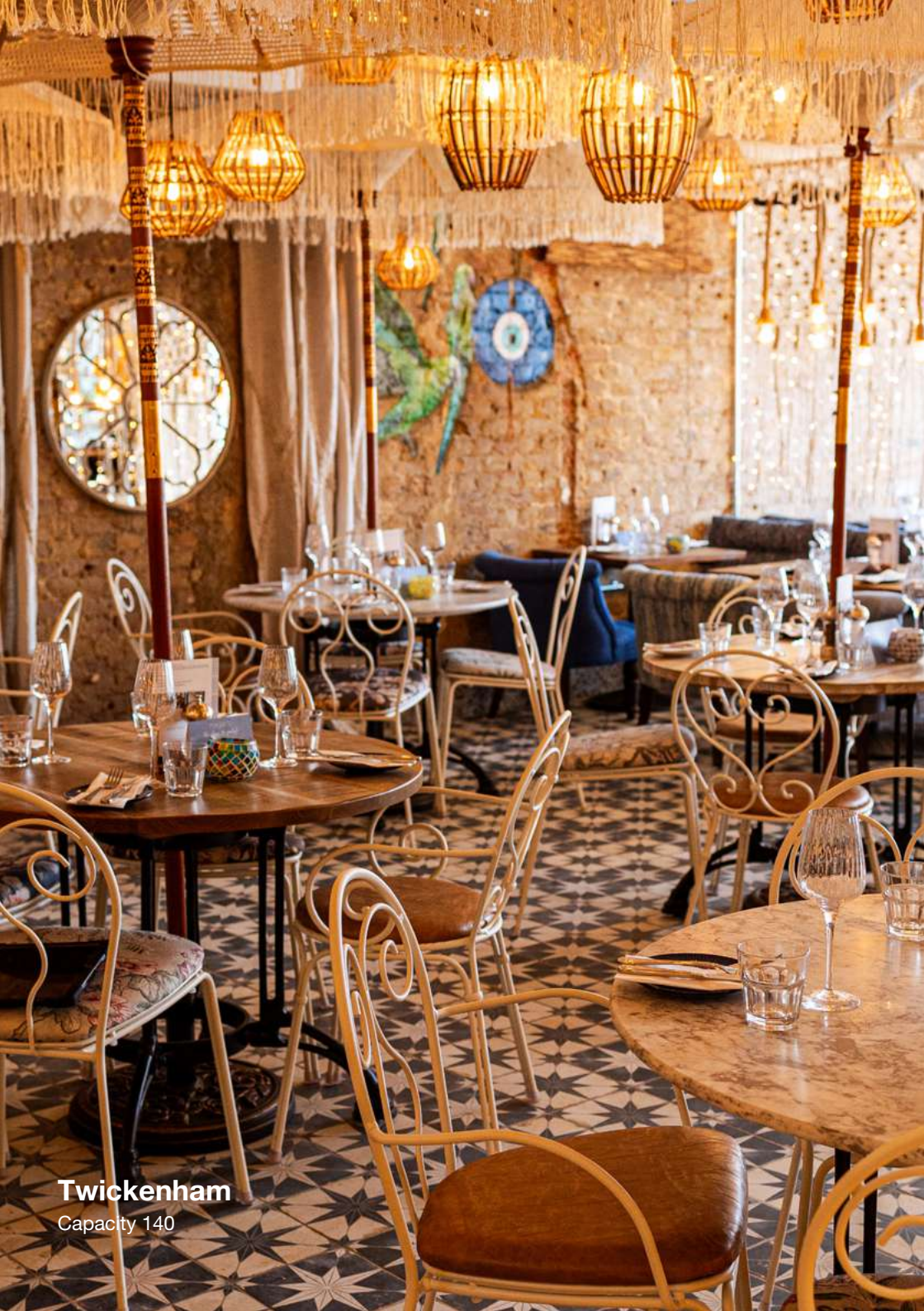
Twickenham Capacity 140