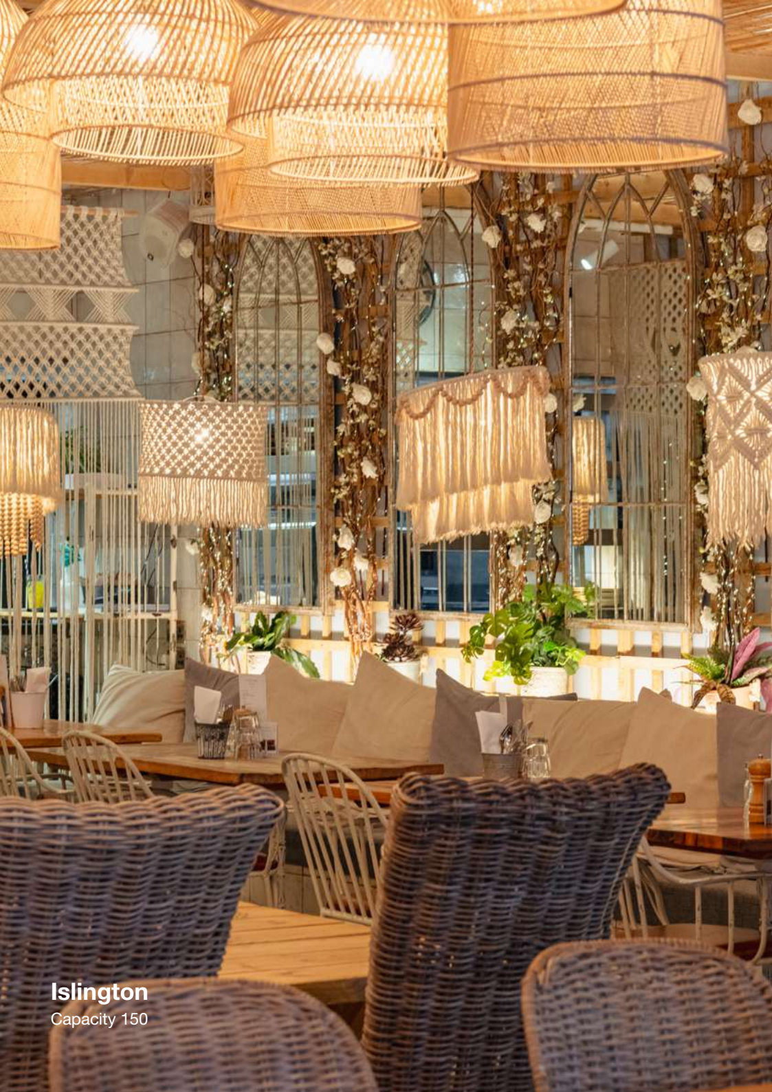
Islington Capacity 150