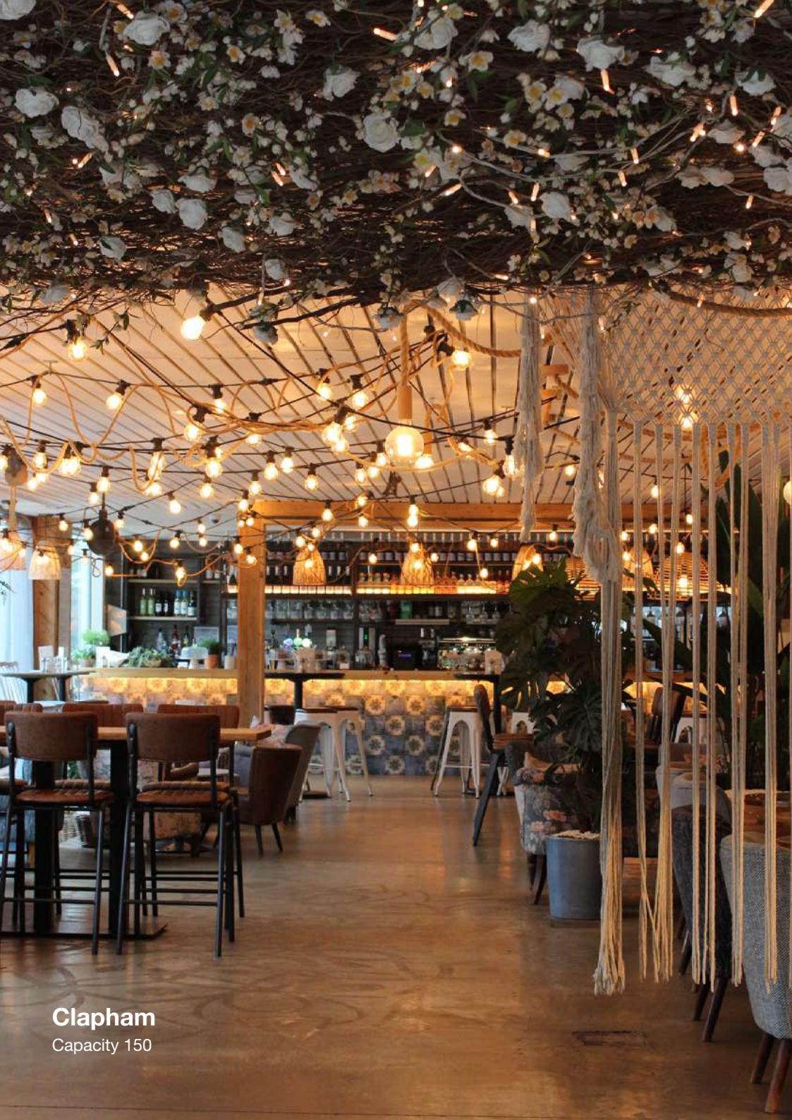
Clapham Capacity 150