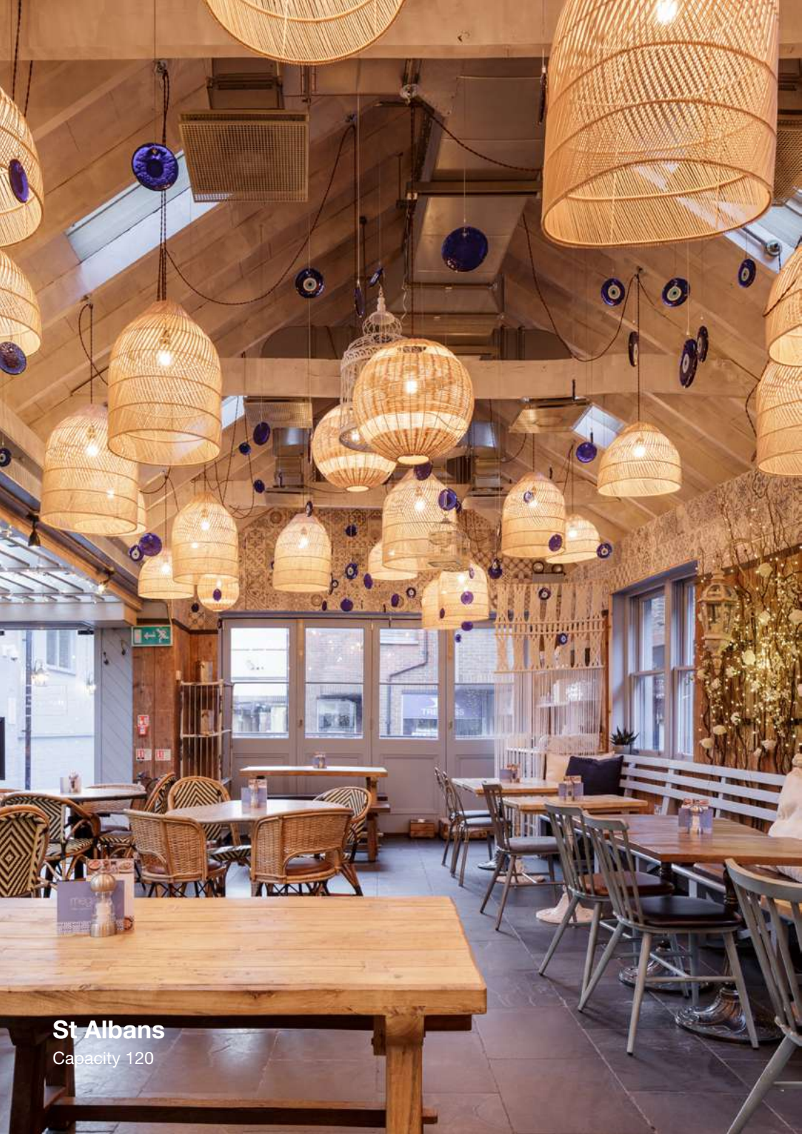
St Albans Capacity 120