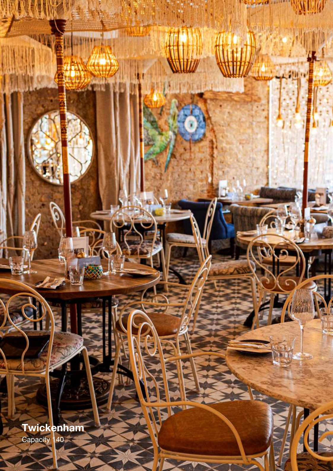
Twickenham Capacity 140